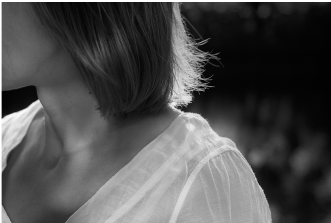
Let Me Be Alone