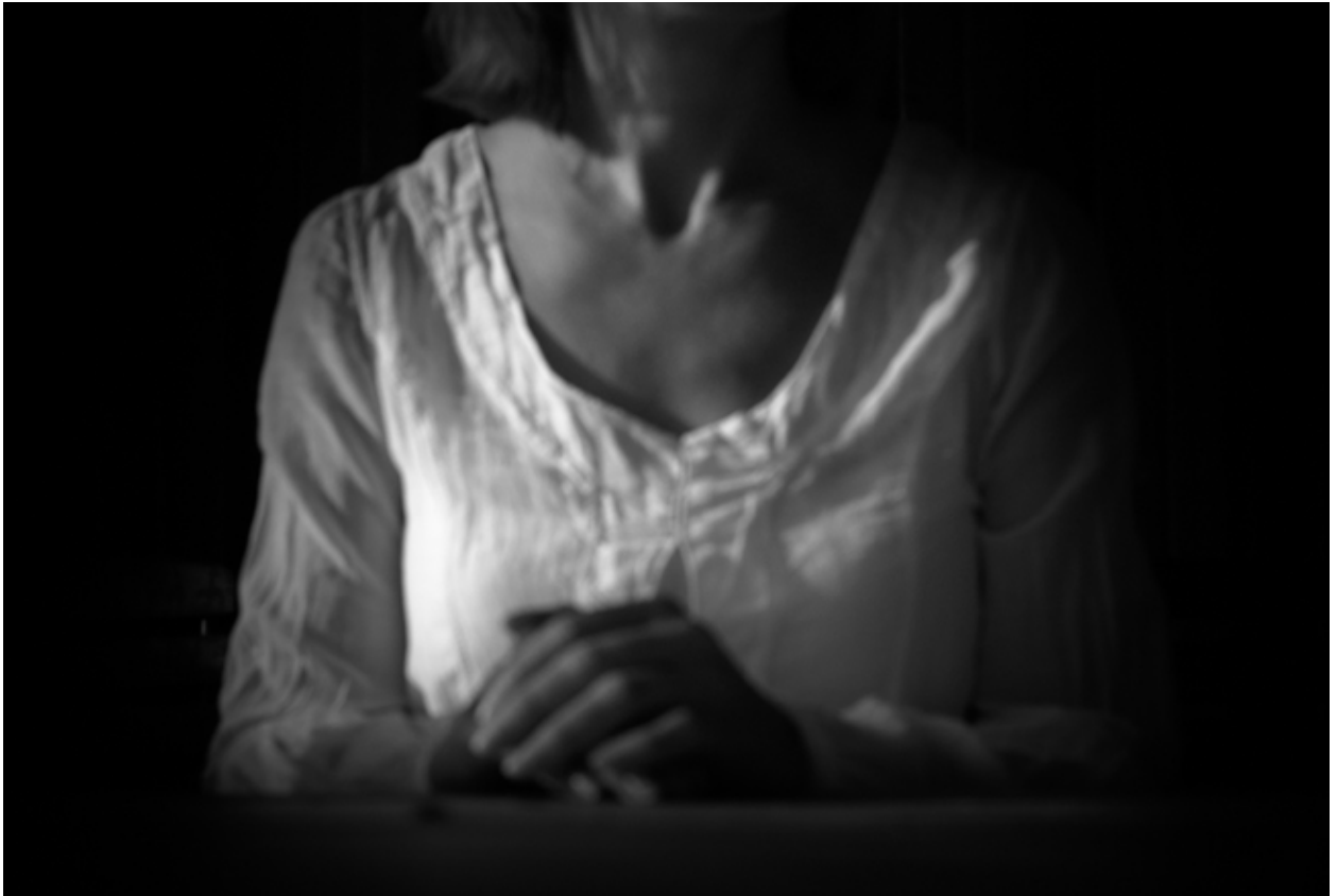
Waiting For You