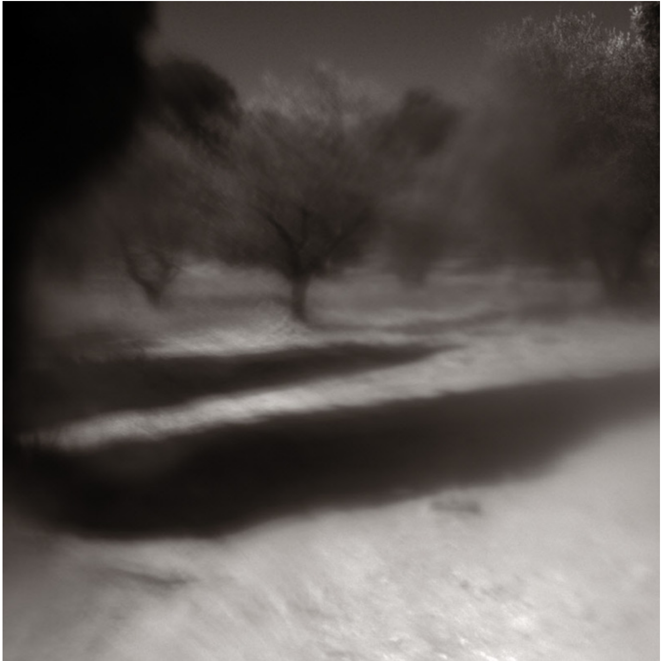
Shadows Of Summer

AN: You have four series of images in your online project gallery, each series focuses on a particular theme. Where do your ideas and inspiration come from?